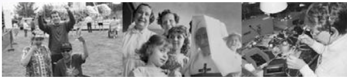
Making a Difference Every Day - Then and Now